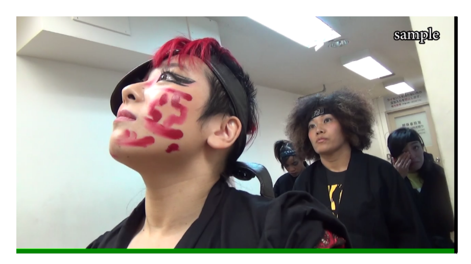
Fig. 7. The monumental stillness of Act. After Gamushara.

In keeping with such de-centering of Yasukawa, After Gamushara visually implies that the ring may be turning into a place of repression rather than freedom for the performer during what would be her final matches. As she awaits the announcement of her name to enter the arena, she stands in front of her teammates, the villainous troupe known as Ōedo Tai (Fig. 7).