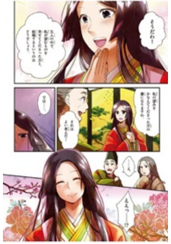
Figure 16. Kaguya-hime smiles. Manga de yomu Taketori monogatari.