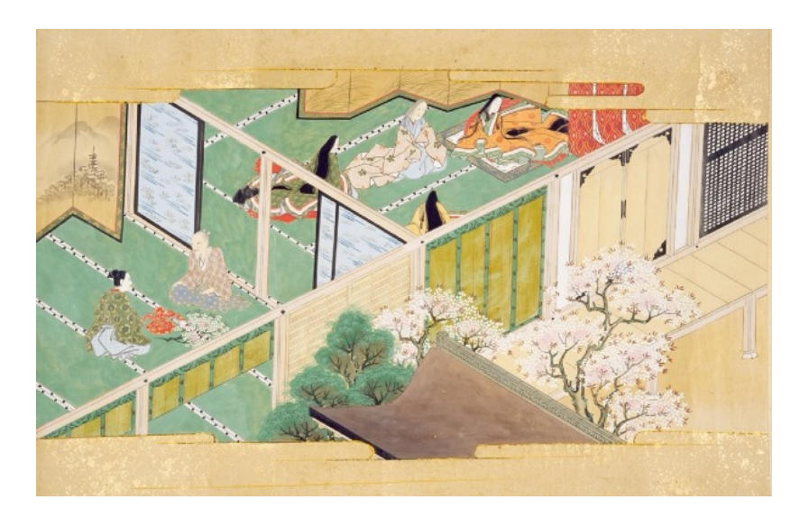
Figure 18. The bamboo cutter converses with a suitor.