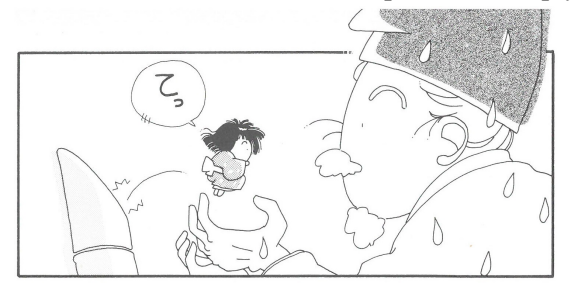
Figure 7. Kaguya-hime appears as a young girl. Komikku sutōrī watashi tachi no koten: Taketori monogatari.

is a moon inhabitant who is extremely beautiful and immortal, unlike an ordinary girl who grows into a lady, with only a single idiosyncrasy of being born from a bamboo stalk. Accordingly, manga have elided the juxtaposition between the world of human beings and the world of the moon inhabitants, which is deeply related to the theme of Taketori monogatari as suggested by modern scholars.<sup>28</sup> The portrayal of Kaguya-hime as a baby or a cute girl quickly implies that this interpretation has emerged recently. If modern Japanese people still regard the juxtaposition between moon people and human beings as an important fact in the story, Kaguya-hime would be described as "a transformed being" in some form or another. For example, a representation of the princess as a respectable lady could easily convey that she is somehow different. However, most modern versions contain no aspects that imply Kaguya-hime's superior