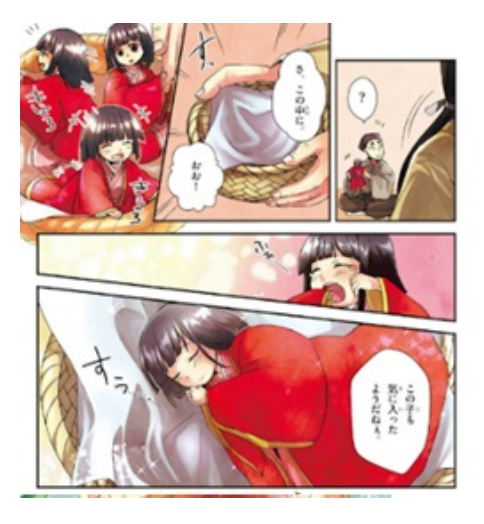
Figure 13. Kaguya-hime appears as a smiling girl. Manga de yomu Taketori monogatari (Courtesy of Gakken kyōiku shuppan).