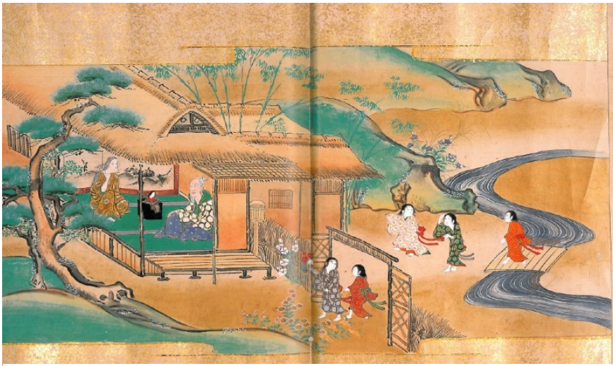
Figure 4. Several children have come to the bamboo cutter's residence.