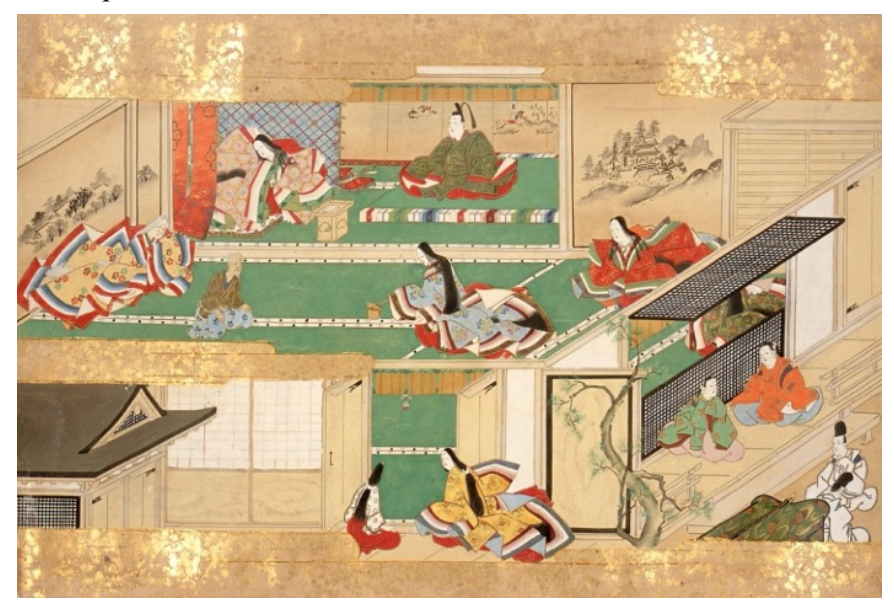
Figure 2. The emperor is depicted with his face visible (Courtesy of Rikkyo University).

ehon and nara emaki suggests that between the fourteenth to the nineteenth century Kaguya-hime, a moon-lady, was considered more esteemed than the emperor.