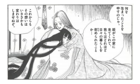
Figure 26. The old woman hugs Kaguya-hime tightly and comforts her. Manga koten bungaku Taketori monogatari.

Though not featured in the premodern text, modern manga versions have added the old woman for a reason. Again, for modern readers, it is natural that a mother figure takes the main role in parenting. It must be for