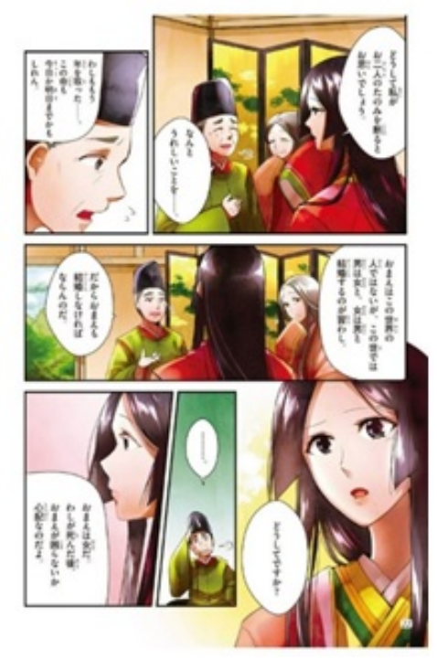
Figure 24. The bamboo cutter and his wife try to persuade Kaguya-hime to marry a suitor. Manga de yomu Taketori monogatari.

suggests to the old woman that she host a coming-of-age ceremony for the girl. Again, the mentor does not exist in the premodern text, hence this scene is newly crafted to show the close relationship between the old woman and the girl. Here, the bamboo cutter is completely absent; he will only learn about the conversation later on from the old woman. This new episode reveals the importance of the old woman in this manga. It should seem natural for modern readers that the old woman, a female character, takes the main role of parenting. In the scene, the old woman laments that Kaguya-hime has grown up, as her words reveal: "It's sad that she grows up so fast" ( Konna ni hayō seijin shite shimōte.... Nani yara sabishūte narimasenu no ja ) (Figure 25).<sup>35</sup> Moreover, when the bamboo cutter persuades Kaguya-hime to marry a suitor, he t ells her that she is not his