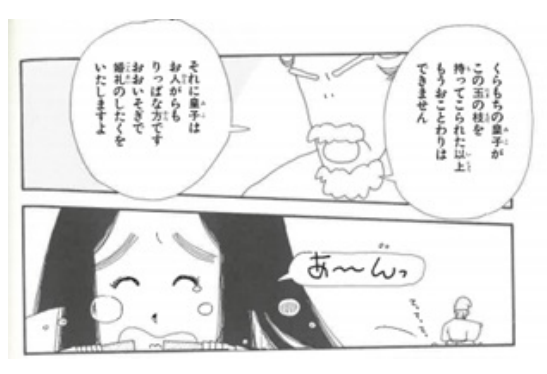
Figure 15. Kaguya-hime cries vigorously. Komikku sutōrī watashi-tachi no koten: Taketori monogatari.