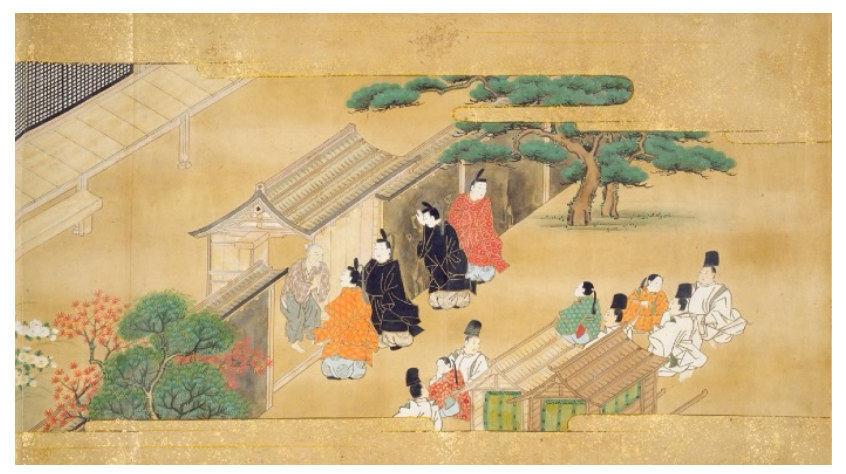
Figure 17. The bamboo cutter meets the suitors.