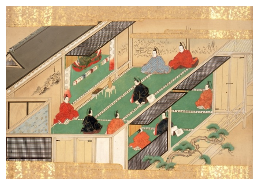
Figure 3. The emperor is depicted with his face hidden.