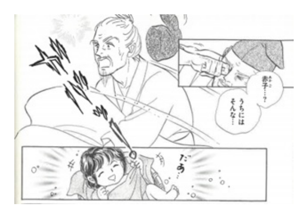
Figure 10. Kaguya-hime appears as a smiling baby. Manga koten bungaku Taketori monogatari.