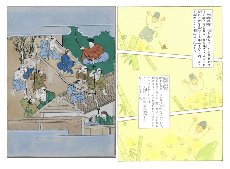
Figure 19. The bamboo cutter carries a bow

Another important difference in the depiction of the bamboo cutter in the premodern texts of nara ehon and nara emaki versus modern manga is the status of his wealth. In the premodern texts, the wealth of the bamboo cutter is not as important as the depiction in modern versions. For example, in the premodern texts, the change of residence suggests the bamboo cutter is now well off. This detail along with the scene of him being poor and discovering a piece of gold in the bamboo shoots is completed elided. Except for one example that features the bamboo cutter as holding a piece of gold in his hand, almost no nara ehon nor nara emaki describe gold.<sup>31</sup> In contrast, the scene in which gold pours out from the bamboo stalk is very popular in the modern versions. It appears in almost all manga and picture books, including the three versions that I discuss here (Figures 20–22). The bamboo cutter finds a piece of gold at each of the bamboo stalk in modern versions.