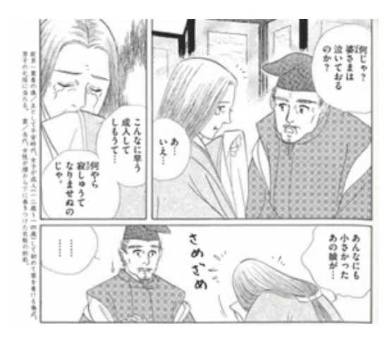
Figure 25. The old woman laments that Kaguya-hime has grown up. Manga koten bungaku Taketori monogatari (Courtesy of Shōgakukan).

In Manga koten bungaku , the old woman also appears in this scene. When the bamboo cutter tells Kaguya-hime that she is not his child, she begins to cry and implores "Please forgive me. I have been selfish because you love me so much" ( Ofutari no fukai aijō ni amaeppanashi de wagamama bakari mōshiagete kita watakushi o dōzo oyurushi kudasaimase ).<sup>37</sup> The old woman hugs Kaguya-hime tightly and comforts her (Figure 26).