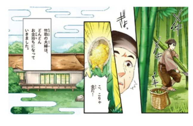
Figure 22. Gold pours out of the bamboo stalk. Manga de yomu Taketori monogatari.

Figure 21. The gold pours out the bamboo stalk. Manga koten bungaku Taketori monogatari.