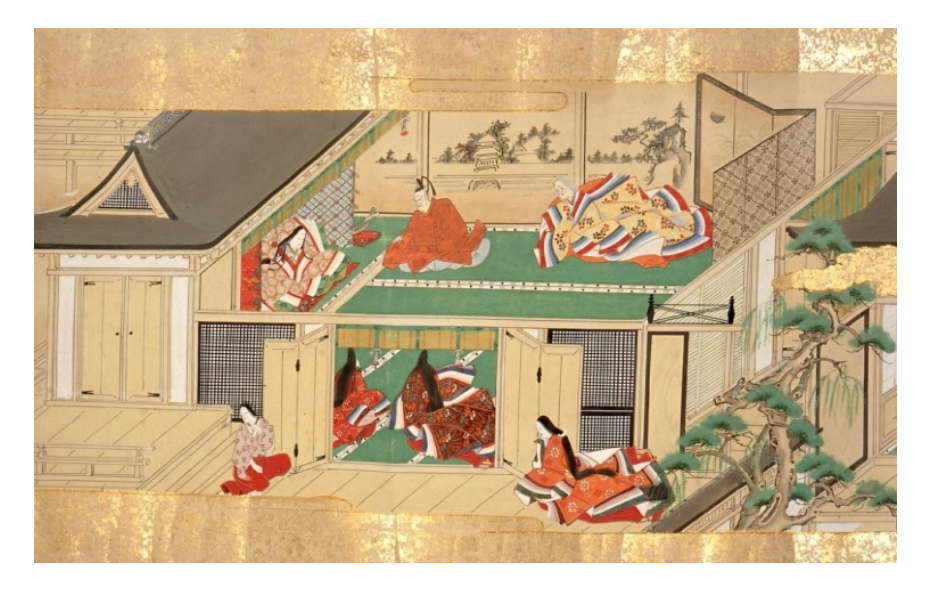
Figure 23. The bamboo cutter appears in rich clothes.

Another example that emphasizes the bamboo cutter's centrality in nara ehon and nara emaki is the scene where the emperor's servant Fusako arrives at the bamboo cutter's house. The emperor hears about Kaguya-hime's unrivaled beauty and asks Fusako to visit the old man's house to discover what kind of a woman Kaguya-hime is. In the premodern tale, unlike other scenes, the old woman mediates between Fusako and Kaguya-hime in this scene. However, many nara ehon and nara emaki depict the