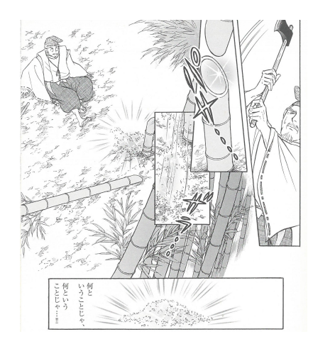
Figure 21. The gold pours out the bamboo stalk. Manga koten bungaku Taketori monogatari.