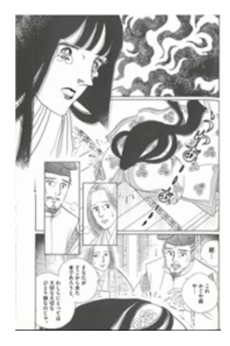
Figure 11. Kaguya-hime cries vigorously. Manga koten bungaku Taketori monogatari (Courtesy of Shōgakukan).