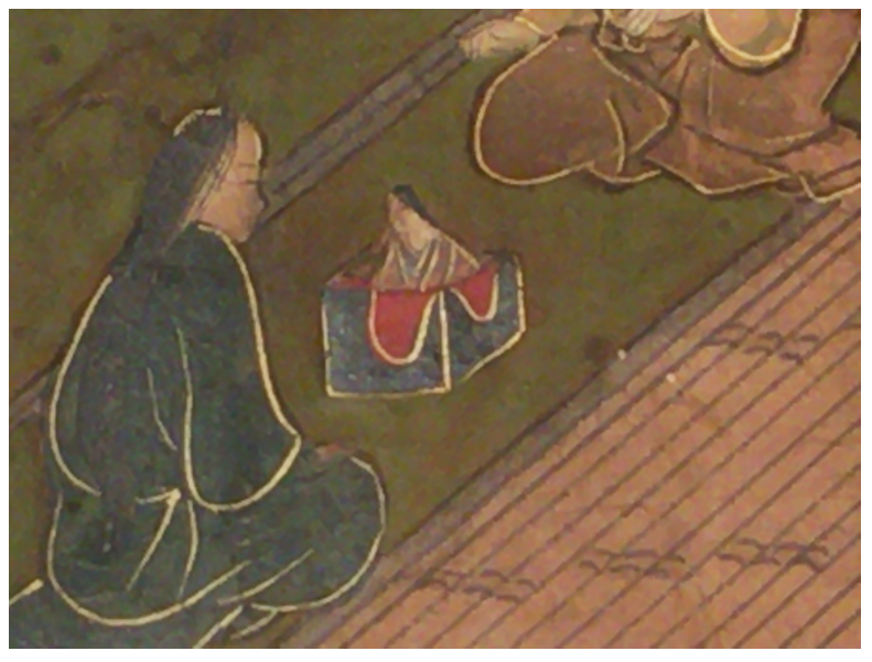
Figure 1. Kaguya-hime appears with long hair in nara-ehon.

I begin my analysis of the image of Kaguya-hime in modern manga by comparing it to representations of the heroine in nara ehon and nara emaki . In these premodern illustrated versions of the tale, Kaguya-hime often appears as sitting in a box or basket and is depicted as a lady with long hair and dressed in many-layered garments ( jūni hitoe 十二単) (Figure 1).<sup>17</sup>