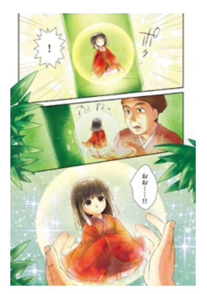
Figure 8. Kaguya-hime appears as a young girl. Manga de yomu Taketori monogatari (Courtesy of Gakken kyōiku shuppan).