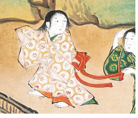
Figure 5. Kaguya-hime appears with long hair and dressed in multilayered garments