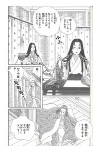
Figure 14. Kaguya-hime smiles. Manga koten bungaku.