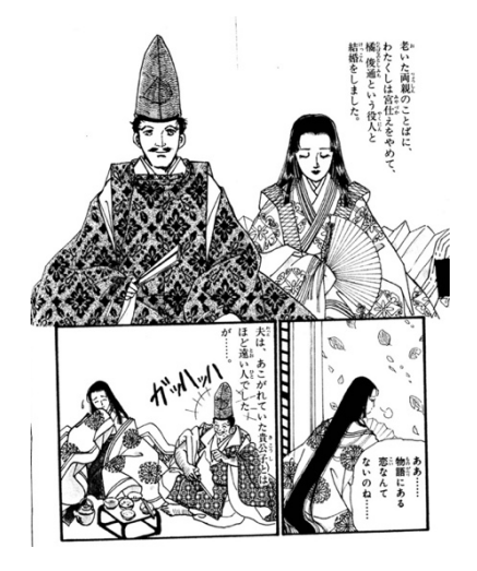
Figure 9. Hime gets married and accepts that there is not fairytale romance in real life (Kōzuki 1993, 106).