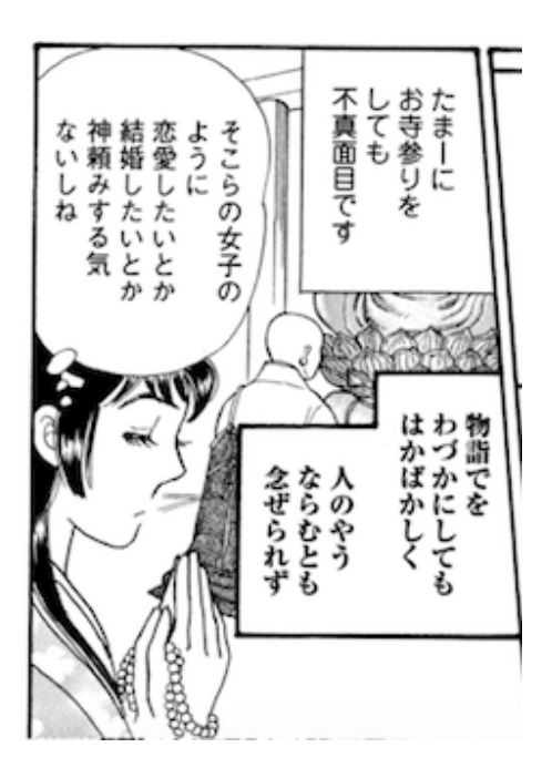
Figure 12. Left. Heroine does not feel like doing what society expects from her (love, marriage, religious practice) (Shimizu 2014, 57).

In this manga, the visual presentation is typical of shōjo manga, depicting female characters with big eyes, using flowers at emotional scenes, constructing the story in collage-like panels, and (like earlier adaptations) showing characters with Western hairstyles and glasses. Numerous modern artifacts and notions give the ancient storyline a contemporary feel. For example, the heroine's sister is sporting glasses and is described as an okarutozuki no bungaku shōjo \pi\pi\pi\nu \beta \sigma \construction (young female bookworm attracted to the occult), and her step-mother is referred to with the familiar and colloquial term mama \neg \neg (mother), written in katakana, and is portrayed with a Western hairstyle, giving the peace sign as if posing for a photo (Fig. 13).