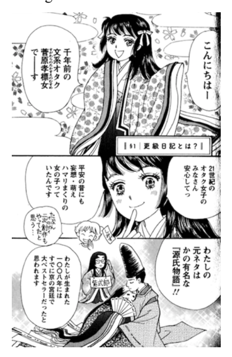
Figure 10. Opening page of manga 2014: "Hello, I am an otaku like you!" (Shimizu 2014, 5).

Shimizu, who poses as a teacher and lavishes on readers humorous and informative comments throughout the work (Fig. 10, middle). This image of the protagonist as an otaku increases the manga's appeal and presents the classical work as one transcending the eleventh century text as universal and resonating with the present. However, despite being innovative and presenting a protagonist who identifies with pop-culture and transnational values, this latest manga is the one that follows the classical text of the diary most closely, as well as being the most informative among the three adaptations analyzed in this article. Containing almost all episodes, this manga opens with a detailed introduction to the setting, historical period, and major themes in the diary, and includes key passages and poems in classical Japanese accompanied by modern Japanese translation and detailed commentary. This in-depth presentation of the language and culture of the eleventh-century work is in line with the new curriculum guidelines of the Japanese Ministry of Education, Culture, Sports, Science and Technology, promoting the importance of Japan's "traditional linguistic culture" (dento-teki na gengo bunka 伝統的な言語文化). These new guidelines focus on the importance of tradition and culture and children's early exposure to the country's heritage.<sup>80</sup>