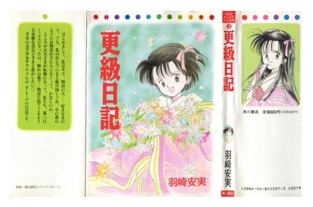
Figure 1. Manga 1991 dust cover, featuring Sara-chan's self-introduction, and showing the heroine as a young girl (left) and an adolescent (right).

miyako 花の都), or Kyoto, in this case—a classical eulogistic or poetic term for a capital, also used in contemporary Japanese to refer to cities associated with romance and beauty, such as Paris or Florence.<sup>25</sup> The use of the term "capital of flowers" suggests a story that focuses on beauty and romance. The short self-introduction of the main character on the dust jacket of the manga enhances the cute and girly image of the heroine conveyed by the Table of Contents (Fig. 1).