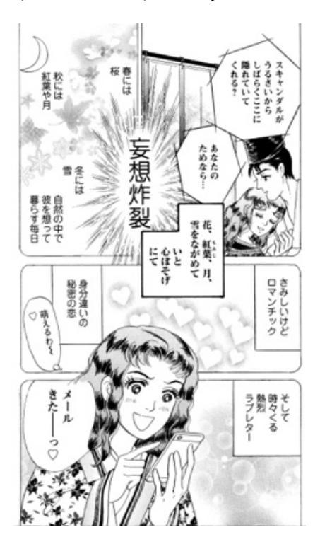
Figure 15. Heroine dreams about being visited once a year by someone like Genji (Shimizu 2014, 58).