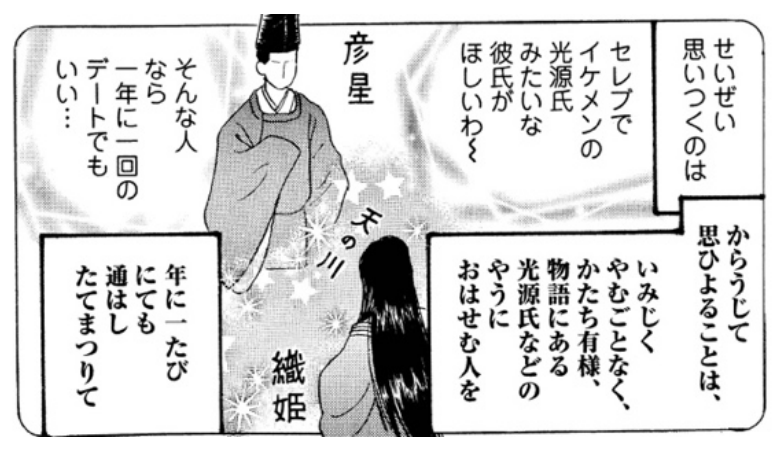
Figure 15. Heroine dreams about being visited once a year by someone like Genji (Shimizu 2014, 58).