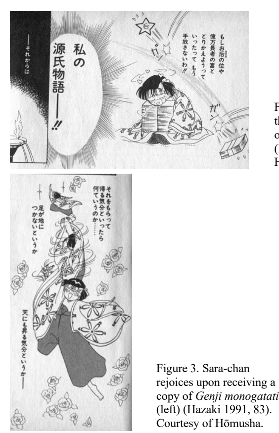
Figure 2. Sara-chan is happier than a queen or billionaire to own a copy of Genji monogatati (Hazaki 1991, 84).

tales (Fig. 1).<sup>32</sup> Similar to the original, Sara-chan is obsessed with acquiring copies of tales and reading fiction. When she finally receives a full copy of Genji monogatari , she is overjoyed, clutching the book close to her heart and exclaiming "my very own Genji monogatari !" ( watashi no Genji monogatari !?) (Fig. 2).<sup>33</sup>