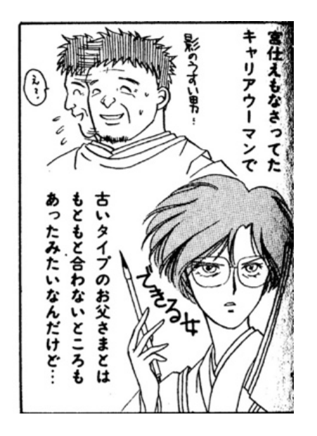
Figure 5. Sara-chan's stepmother is a "career woman" (Hazaki 1991, 73).

Sara-chan's strong career aspirations reflect the increasing participation of Japanese women in the workforce after the enactment of the Equal Opportunity Bill in 1986, which made a growing number of career-track jobs available for women and contributed to the social acceptance of the term "career woman" kyaria ūman キャリアウーマン (Fig. 5).<sup>49</sup> At the same time, the heroine's concern about marriage reflects social attitudes in the workforce in the early 1990s when, despite the growing number of professional women, there was significant discrimination against female workers because of persisting stereotypes that portrayed women primarily as wives and mothers.<sup>50</sup> Shaped by the traditional stereotype of koshikake shūshoku 腰掛け就職, or temporary employment for women ending with marriage, the manga character Sara-chan quits her job after marriage. She follows the most commonly acceptable model for a woman's life in the early 1990s, that is becoming a sengyō shufu 專業主婦 (professional housewife).