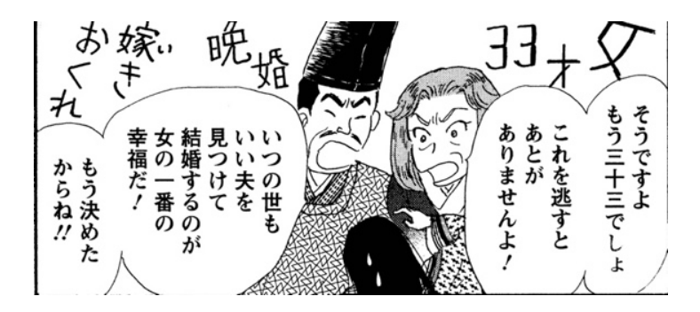
Figure 19. Heroine's parents try to convince her to get married (Shimizu 2014, 88).

The next frame shows the protagonist's mother warning her daughter that this may be her only chance to get married because of her advanced age. She further reminds her that marriage is a woman's greatest source of happiness at any age and time ( itsu no yo mo ii otto o mitsukete kekkon suru no ga onna no ichiban no kōfuku da ) (Fig. 19).<sup>85</sup> Like the previous two manga, the scene reflects conservative attitudes regarding marriage and women's roles in Japanese society since the Meiji period, which are still prevalent today. However, this is the only manga of the three presenting the heroine's strong resistance to marriage. It reflects a steady social trend that started in the 1970s, and concerns women's choice of career over marriage. This trend has been negatively labelled mikonka 未 婚化 (tendency to remain single) and bankonka 晚婚化 (tendency to marry late in life). Bankonka is the term used in the scene where the heroine's parents try to convince their daughter to get married (Fig. 19).