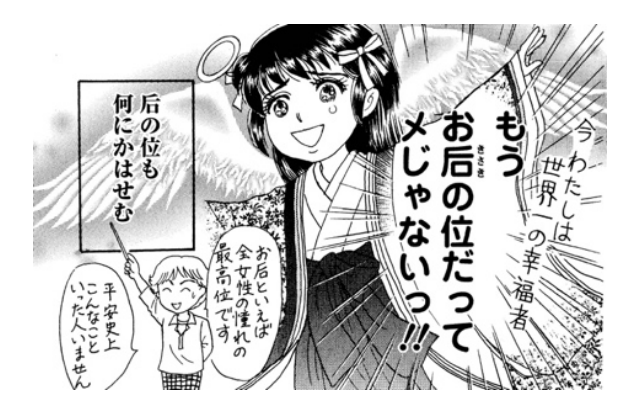
Figure 11. The heroine's ecstatic joy upon receiving The Tale of Genji makes her feel like "the happiest person in the world" (Shimizu 2014, 41).

This manga's ability to simultaneously entertain and educate is exemplified by the heroine's passion as an otaku reader who is overjoyed at receiving the entire Genji monogatari . The scene is emotional and comical, showing the elated heroine in a close-up panel (Fig. 11). Her teary eyes, a halo around her head, and the angel wings she has, similar to the first manga, reveal her exhilaration. The protagonist exclaims that she is the happiest person in the world ( sekai ichi no kōfukumono 世界一の幸福 者) and utters loudly (as suggested by the bold letters) that not even the status of an empress means anything to her anymore ( mō okisaki no kurai datte me janai ) (Fig. 11).<sup>81</sup> Unlike the other two manga, this statement is also quoted in classical Japanese, and the author of the manga, Shimizu, appears on the panel, posing as a teacher with her pointer. Shimizu explains that an empress had the highest position among women in the Heian period, and that the heroine is the only person in its history to have uttered such a thing ( Heian shijō konna koto itta hito imasen ) (Fig. 11).<sup>82</sup>