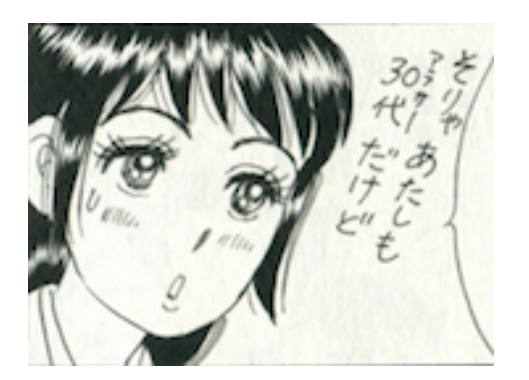
Figure 20. "Well, I am almost thirty after all" (Shimizu 2014, 88).

This manga is an accurate rendition of the world of Sarashina nikki . It educates readers about the language and culture of the eleventh century, while successfully translating the unique artistic world of the diary through effective contemporary equivalents. Although the otaku heroine resembles the protagonists of earlier manga versions in being kawaii and exemplifying traditional feminine values, here she is free thinking, original, independent, and responsible for her actions and life choices.