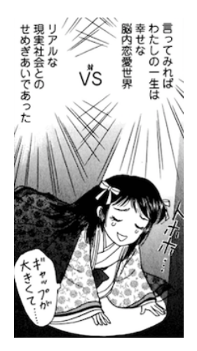
Figure 14. Heroine is torn between romance in her head and real life (Shimizu 2014, 6).

However, despite the similarity in visual style with the earliest manga interpretation from the 1991 Sarashina nikki (NHK Manga de yomu koten) , in this manga the heroine is not focused solely on romance, and her idea of it is in line with the eleventh-century diary—it is an abstract "romantic world all in the head" ( nōnai ren'ai sekai 脑内恋愛世界) (Fig. 14). The idea of romance in this manga is a truthful rendition of the Sarashina nikki heroine's aspiration to be like Ukifune by being visited once a year by someone like Prince Genji instead of striving to engage in real-life full-time romantic relationship, like the heroine in the earliest manga (Fig. 15).