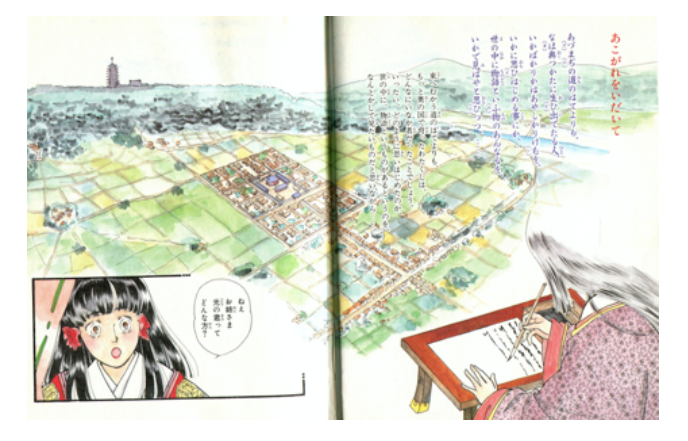
Figure 6. Opening page of manga 1993: the heroine as a young girl and as an old lady, writing her diary, against the backdrop of Kyoto during Heian (Kōzuki 1993, 8– 9).

The protagonist is no longer Sara-chan but is referred to as hime 姫 (princess or lady), an appellation that stresses her aristocratic status and reminds young readers that she belongs to a world different from theirs. Frequently using honorifics ( keigo 敬語) and feminine sentence ending particles, such as wa i, no \mathcal{O} , ne i and yo \sharp , the protagonist emerges as a well-bred and respectful girl who is cute but not silly, unlike the heroine of the earlier manga. This adaptation, too, employs techniques typical for shōjo manga—with full-size panels in a collage arrangement, depicting a feminine, refined, and reasonable protagonist with unnaturally large eyes and surrounded by flowers. The story is told in the first person, using speech bubbles to convey the heroine's inner world through her thoughts and feelings, which is typical for shōjo manga.