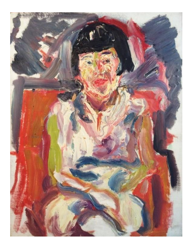
Figure 2. Untitled, undated portrait of Kōno Taeko, Henry Ichikawa. Courtesy of the Kōno Taeko estate.

These compositions frequently contrast distant bright yellow suns or flashes of light with murky deep red and brown human figures in the foreground, as if covered in blood or burned flesh. In one haunting painting, a human form has been disfigured and burned beyond recognition, but the startling white of human eyes gaze out of a painful corporeal shell (Figure 3). Another painting is unusual among all of Ichikawa's genbaku works, exhibiting characteristics of both his genbaku expressionistic style and the abstract two-dimensional shapes and vibrant colors in "September 11, 2001"; indeed, this painting's composition literally divides the canvas into two planes, the upper half abstract and geometric while the lower half dramatizes the representational figure of a woman crouched over and embracing her dead child in a posture suggestive of death and childbirth simultaneously (Figure 4). Here a motif