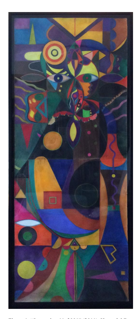
Figure 1. "September 11, 2001" (2011), Henry Ichikawa.