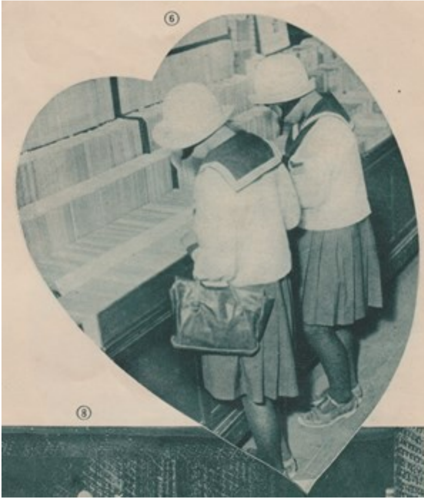
Fig. 1. Two schoolgirls browsing in a bookstore

“grateful” for artificial scents that remove one from nature to a certain extent. It is only when they get excessive that she objects, saying they disorient and stimulate people’s senses, rather than bringing them closer to nature.